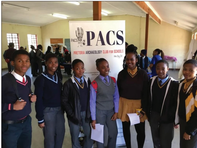
Image 4: Learners at the Archaeology Open Day held at Mamelodi High School in 2017

PACS has gone beyond these activities and in 2017 we launched the Archaeology Open Day (see Images 4 and 5). The Open Day included various academics and university students who are experts in archaeology, palaeontology, and other heritage-related disciplines presenting their work in the townships. It is a platform where learners, teachers, and community members have access to information and are able to ask questions. This assists in teaching the community about the various activities involved in archaeology and other related disciplines.