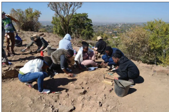
Image 6: Learners taking part in a real-life excavation at East Fort