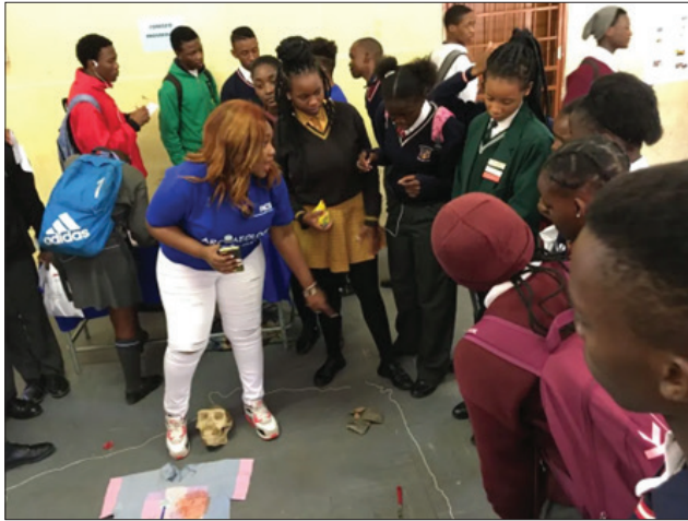
Image 5: Learners participating in an experiment during the Archaeology Open Day in Mamelodi