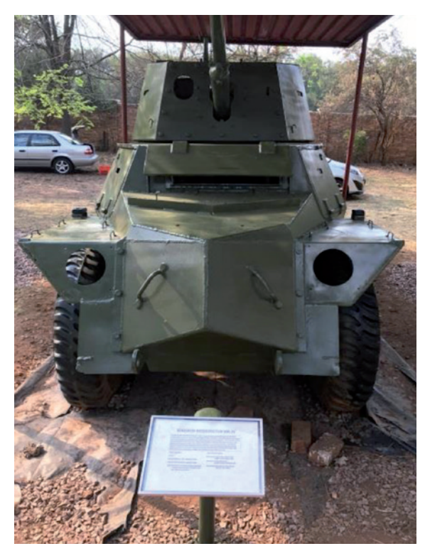
Image 2: The Marmon-Herrington MK IV after renovation (with permission from the museum)

...with a different perspective towards history and its importance of educating the next generations about the past.