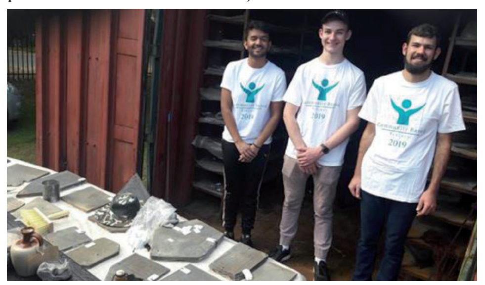
Image 1: Students in front of the container with some of the gravestones (with permission from the students and museum)

The reality of working with only the physical remembrance of the people whose lives ended in that camp... We quickly realised that some of the gravestones are fragile and should be handled with care. What really had an impact on me was the differences that exist between the gravestones. Some are made by professionals, while others are homemade, most of the time because the family could not afford to have a gravestone made professionally. One other thing that had an impact on me was the incomplete dates on some gravestones. This is mostly due to the people in the camp not knowing what the date was at the time. The people in the camp were so disconnected with the outside world that even the date was unknown to them.