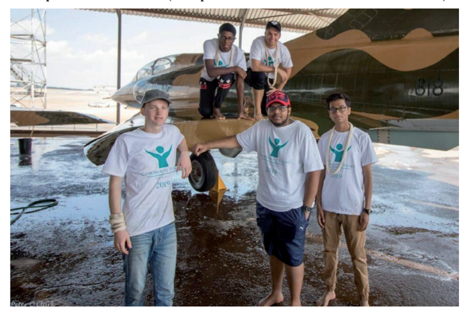
Image 3: A group of students that were assisting with the maintenance of the Swartkop Air Force Museum (with permission from the students and museum)

Every year, students assist the Swartkop Air Force Museum to get it ready for its annual air show. An alumnus organised the 50 students into groups of five and made sure that all the hangars and exhibitions were cleaned and in working condition. Final-year students served as mentors and monitored the execution of the projects. This is one of the most popular projects of the module and students have to apply to be part of the project. Students are interviewed to determine if they have the correct focus and motivation to complete the project.