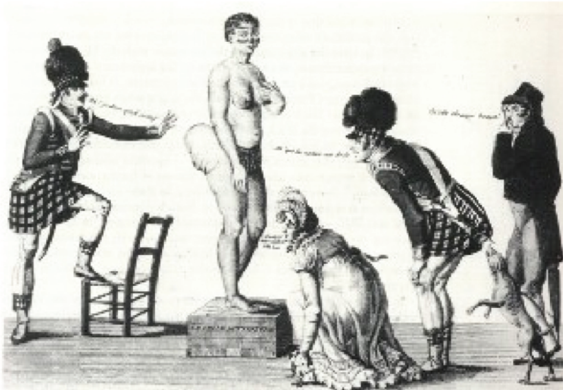
Baartman objectified. An early nineteenth century French print entitled La Belle Hottentot .

She spent four years in London, then moved to Paris, where she continued her degrading round of shows and exhibitions. In Paris she attracted the attention of French scientists, in particular Georges Cuvier.