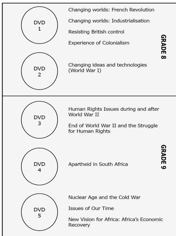
Figure 1: DVD Set for Grade 8 and 9 History