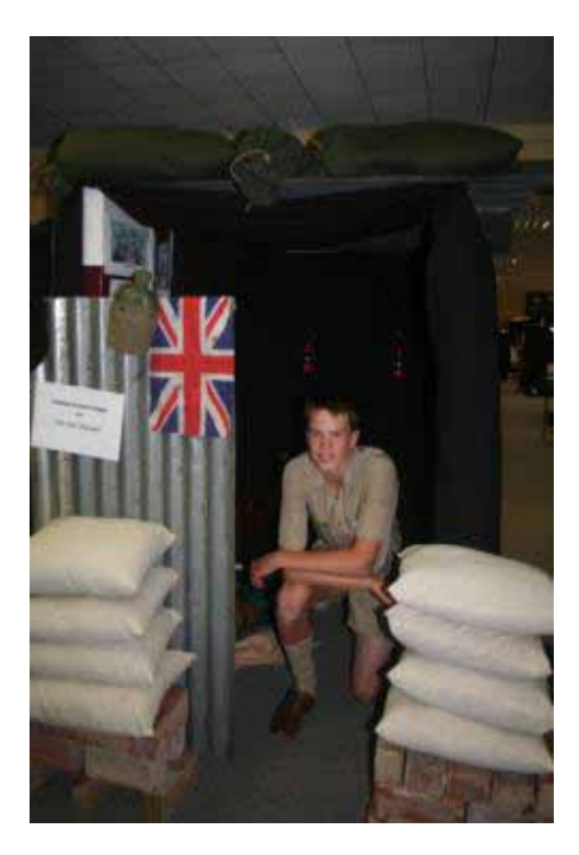
Image 2: Another display from a Kearsney College history evening.

In this short article I shall mainly be discussing one way in which Grade 9s, their parents and the school management might be reached. In this case I am referring to the History evenings held at Kearsney College in KwaZulu-Natal.