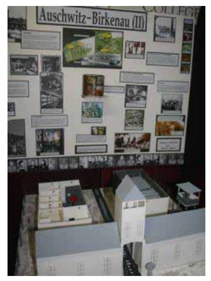
Image 1: A poster and model showing the Auschwitz-Birkenau (II) camp complex. This was on display at a recent Kearsney College history evening