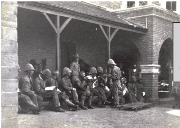
January 1900: Sick and wounded British soldiers recuperating outside the school's Victoria Hall, which will be the primary venue of the 2013 SASHT conference.