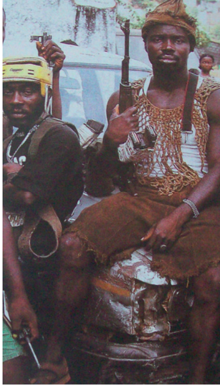
Image 6: Bürgerkrieg auch in Sierra Leone: Kämpfer der Milizen, die auf Seiten der Regierung gegen die Rebellen kämpfen. Foto, 2000 (Civil war also in Sierra Leone: Militia combatants fighting on the side of the government against the rebels. Photo, 2000)