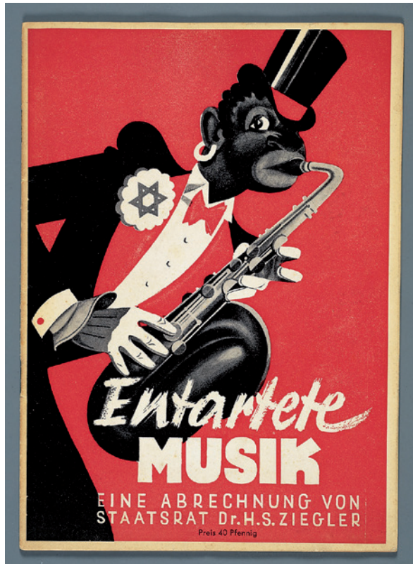
Image 5: Plakat zu der Ausstellung, Entartete Musik, 1938 in Düsseldorf (Exhibition poster, Degenerate Music, 1938 in Düsseldorf)