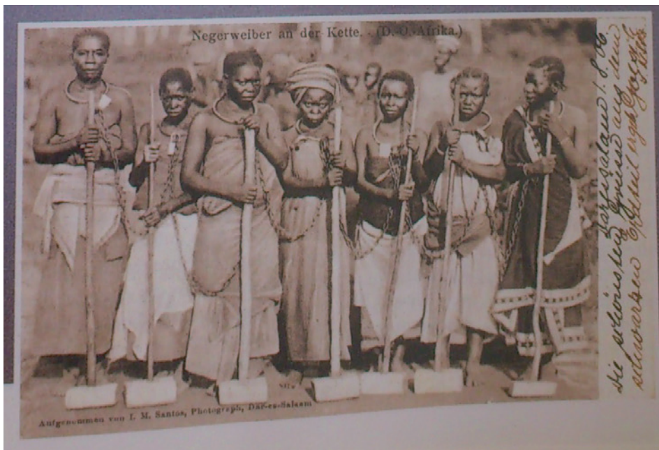
Image 3: Postkarte, Negerweiber an der Kette; die handschriftlichen Grüße lauten: Daressalam, 1.8.06. Die schönsten Grüße aus dem schwarzen Erdteil. ergebendst, Unterschrift (Postcard, Chained N.-women; the handwritten greetings says: Daressalam, 1/8/06. Best regards from the black continent. sincerely, Signature')