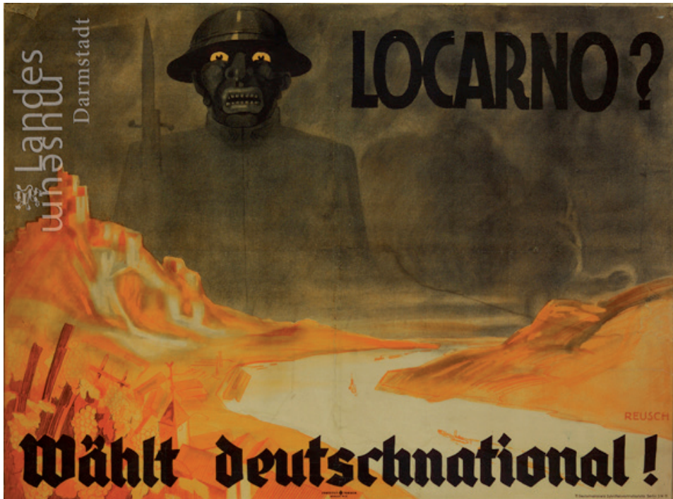
Image 4: Plakat der Deutschnationalen Volkspartei (DNVP) aus dem Jahr 1928. Das Plakat nimmt auf eine Äußerung Stresemanns, der den Vertrag von Locarno als ‚einen Silberstreifen am Horizont‘ bezeichnete (The German National Peoples Party (DNVP) poster from 1928. The poster refers to Stresemann’s statement describing the contract of Locarno as a silver strip on the horizon)