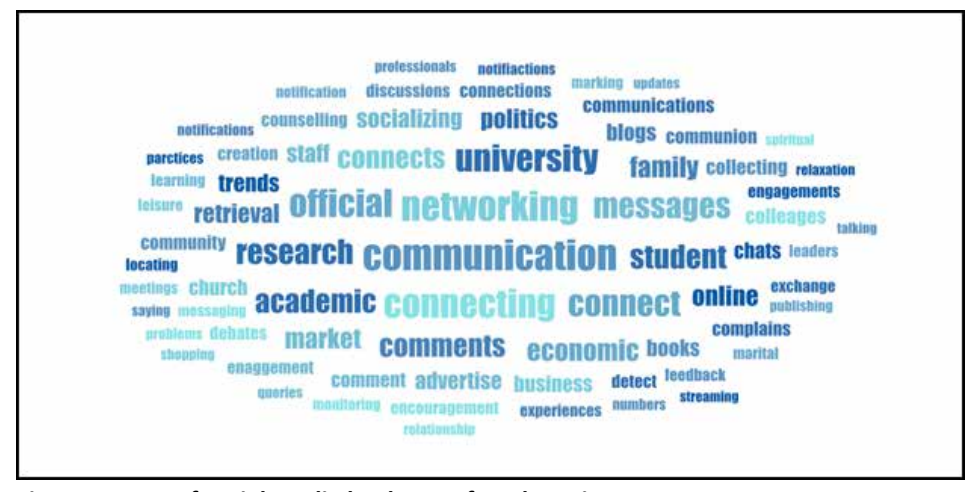
Figure 1: Uses of social media by deans of students in Kenya

who had been cyber-bullied by students were active on Facebook and WhatsApp for at least one hour daily. They used both platforms for official communication with students on institutional matters, follow-up on student activities, and assistance with online learning. This shows that, aside from memos on notice boards, deans of students interact with students online to a large extent and are therefore exposed to hostile online engagement. The deans who reported that they had not experienced cyberbullying also reported that they were not active on social media. A number of them did not have social media accounts. Figure 1 shows what the deans of students use social media for.