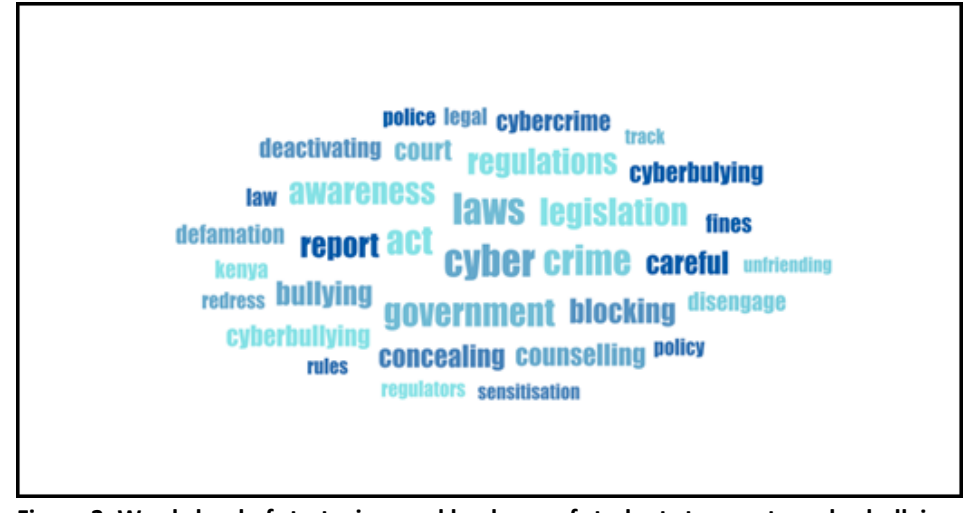
Figure 3: Word cloud of strategies used by deans of students to counter cyberbullying

The findings showed that while the deans of students are aware of the general strategies one can use to curb cyberbullying, most of them felt that the cyberbullying they experienced came with the territory and that they should take it in their stride. Thus, they chose to have a good rapport with their students rather than blocking or disengaging from social media.