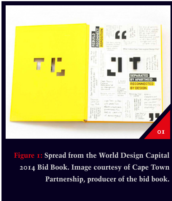
Figure 1: Spread from the World Design Capital 2014 Bid Book.

The World Design Capital is a city promotion initiative or designation that began in 2008. The designation is awarded biennially, by the non-profit organisation, the International Council for Societies of Industrial Design (more commonly referred to as Icsid), to cities that use design and creativity for social, economic and cultural development. The organisation links national, professional associations and serves as a unified voice to protect and promote the industrial design discipline. Although industrial design holds its own as a discipline, owing to the multi-disciplinary nature of design practice, the World Design Capital initiative is not limited to industrial design. Nonetheless, the initial concept was introduced specifically to the Icsid Executive Board with the intention to motivate cities to recognise and use design as a strategic development tool. From conceptualisation, it was hoped that the initiative would garner interest and support from global design networks and especially governments to consider the value of design for economic and social growth. Furthermore, the intention was for the initiative to encourage dialogue about the ‘impact of design on quality of life’ of inhabitants in the