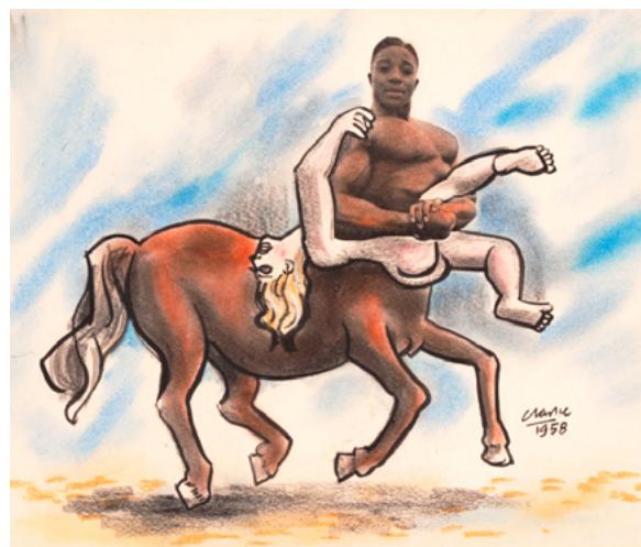
Figure 1: After a silverpoint drawing by Picasso, 1958. Pastel, ink, pencil and collage, 200 x 254. (Artist's collection).

In one of his earliest collages, made in 1958, he quoted Picasso's silverpoint drawing of a Rape , 6 utilising it as a prototype for a witty cross-cultural encounter by the addition of the collaged head and torso of a black body-builder, clipped from a magazine, to the equine body of the centaur who abducts a struggling fair-skinned woman (Figure 1). As well as 'modernising' the Picasso drawing by translating it into the less conventional medium of Craypas and collage, he infuses it with social critique; in both form and content the work anticipates much of Clarke's oeuvre, where ideas drawn from European source material were deployed to new ends. 7 His relationship to such material provides an unusual twist on African Modernism, itself a new take on twentieth-century Primitivism.