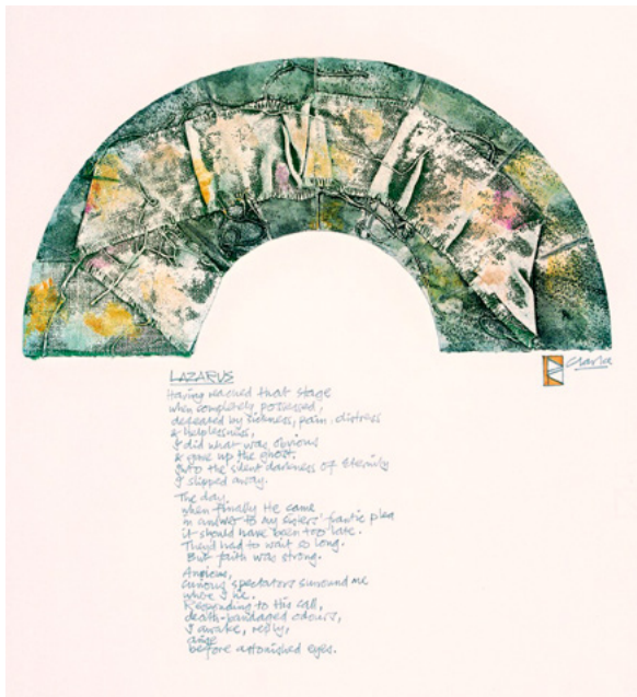
Figure 10: Lazarus. Exhibited 2004. Fan series: folded paper with with cotton bandage, paint and inscribed text, 500 x 350.