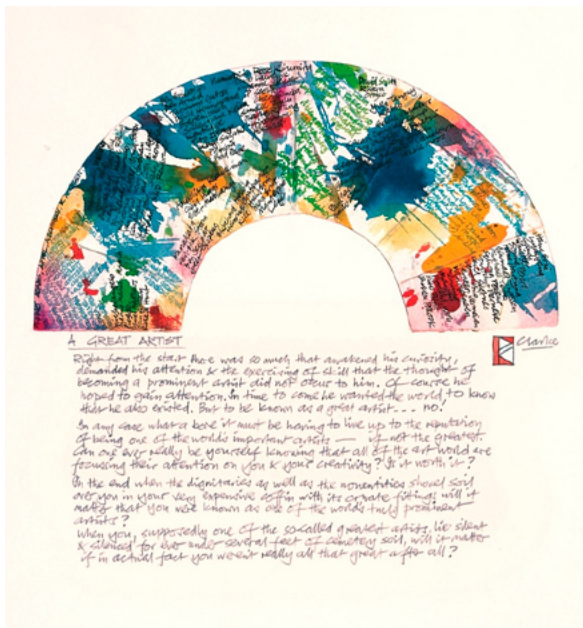
Figure 9: A Great Artist. Exhibited 2004. Fan series: folded paper with paint, penwork and inscribed text, 500 x 350.

knowledge of Modernism. These fans mimic the style of the artist that he honours, with a wrapped fan for Christo , for example, and a collage of miscellaneous fragments and tickets for Schwitters . Yet by transposing styles onto the semi-circular fan shapes and linking the visual forms to a text, as though they are illustrations, Clarke subverts any conventional reading of Modernism. He also expands the twentieth-century canon by creating fans for South African artists, such as Christo Coetzee , Faith Loy Plaut , Nicolaas Maritz , Jane Young , Kagiso Mautloa , The Holo brothers , Walter Battiss , and Sam Nhlengethwa , whose name is spelt in cut-out letters echoing that artist's explorations of collage.