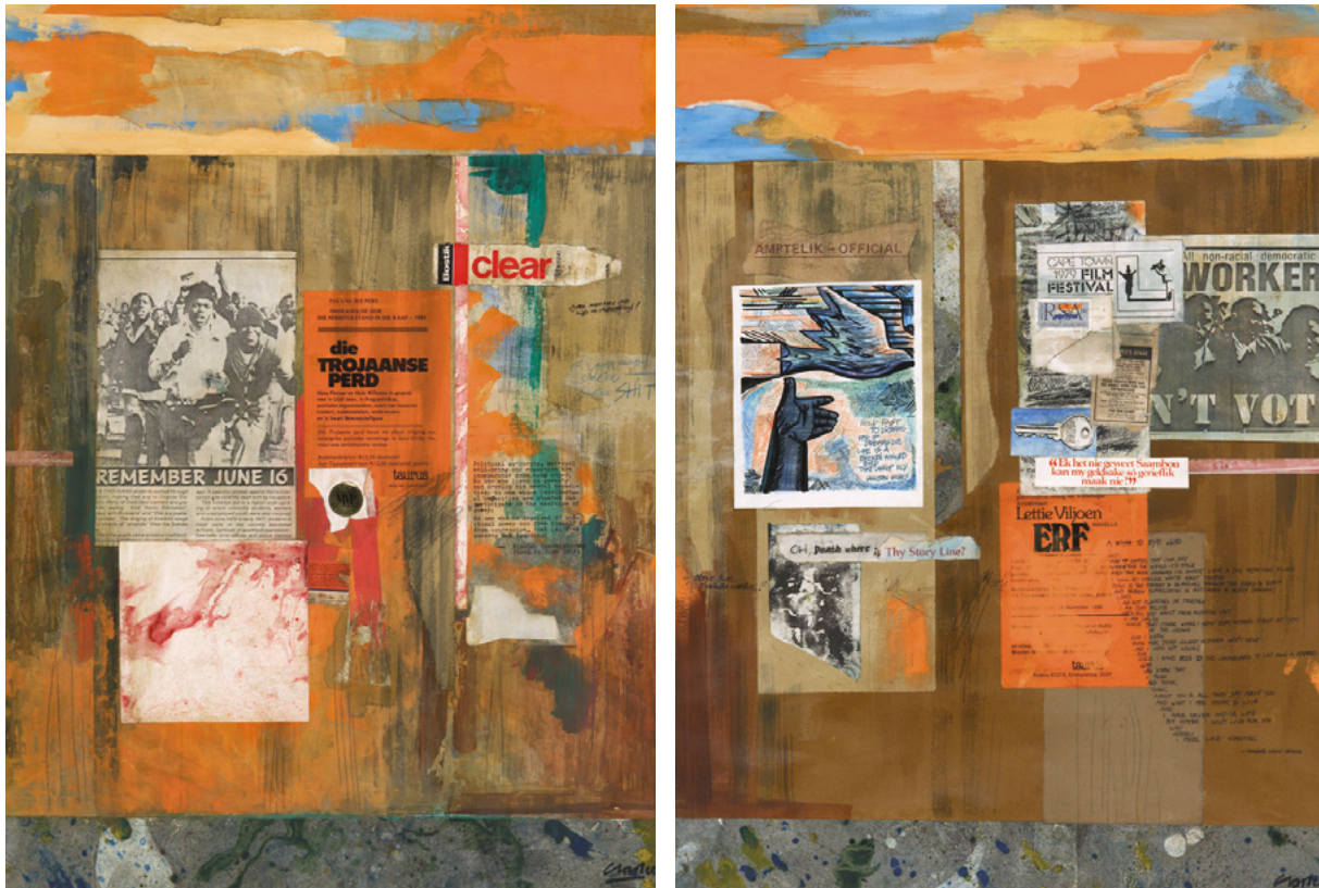
Figure 4: Trojan Horse , c.1990. Diptych. Mixed media and collage, each panel 700 x 470. (Constitutional Court, Johannesburg).

GOD MAY IT HAPPEN THAT ONE DAY WHEN THE SUN WIPES ITS FACE AND THE MOON SHAKES ITS SWEAT LIKE A DOG REMOVING FLIES I WILL NO LONGER WRITE ABOUT PEOPLE DYING ON THE STREET & BLEEDING THROUGH THE EARS & EYES AND BABIES SUFFOCATING IN SUITCASES IN MUDDY DONGAS; LORD I AM NOT PLEADING OR PRAYING I AM JUST POLITE CHOKING MY SHOUT FROM RUSHING OUT 13