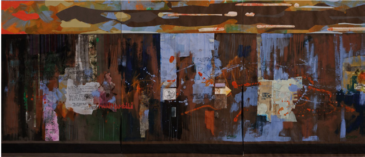
Figure 3: Transition , 1992.

Triptych. Mixed media and collage, each panel 640 x 493. (Artist's collection).