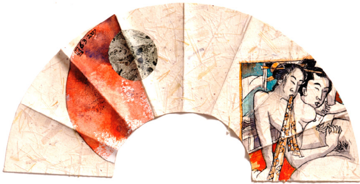
LADY WITH A CHIFFON SCARF IN HER MOUTH