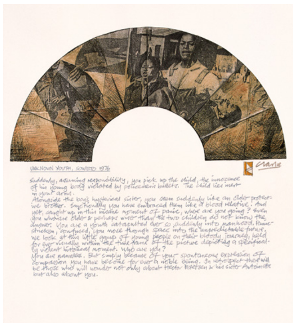
Figure 8: Unknown Youth, Soweto 1976 . Exhibited 2004. Fan series: folded paper with paint, penwork and inscribed text, 500 x 350. (Courtesy Warren Siebrits Modern and Contemporary Art, Johannesburg).

The writer, eventually absolutely discouraged, has placed his books, a huge pile, in his dingy moss-damp toilet. Each time nature calls he uses pages he has torn out. Afterwards he pulls the chain, flushing subversion on its way.