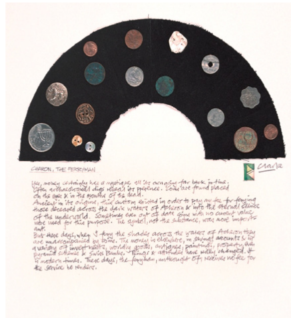
Figure 11: Charon, the Ferryman. Exhibited 2004. Fan series: fabric, coins and buttons with inscribed text. 500 x 350.

But these days, when I ferry the shades across the waters of Acheron they are unaccompanied by coins. The money is elsewhere, in savings accounts & in a variety of investments, worldly goods, antiques, paintings, property, even pyramid schemes & Swiss Banks. Things & attitudes have really changed. It is modern times. These days, the ferryman, unthought of, receives no fee for the service he renders.