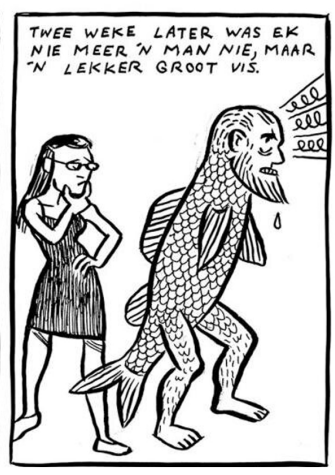
FIGURE Nº 13

Conrad Botes (2020) Fluctuat et Mergitur, p.5 (excerpt). Copyright © 2020 Conrad Botes & Soutie Press.