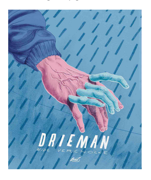
FIGURE Nº 8

to accompany them. The textual son and father discuss photographs of their grandfather in settings with Nazi's. These seemingly "factual" portraits and Vercnocke's drawings of the archives all perform authenticity to the reader. The memory of the archive is combined with the artifice of Vercnocke's depressive blue tones, angular and irregular shape language, as well as the " Drieman " (three man) metaphor of the son, father, and ghostly grandfather all cohabiting in one body.