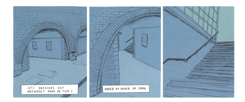
FIGURE No 15

Vercnocke's textual world in Drieman (2020) worldbuilds a Flemish community. We see the train stations, train cars and neighbourhood streets. All these scenes are washed out, with the same pencil-like line quality. In Figure 15, for example, a typical train station is represented. The book's inciting incident and climatic conversation between son, father and grandfather both happen on a highly recognisable Belgian train, complete with the distinct patterns on the seats. While detail is given to the train or the texture of the brick walls and the stairs seen in Figure 15, no recognisable shapes emerge from the advertisements against the walls. Other characters are similarly given little visual attention and detail, or are omitted entirely. This world's rules make Vercnocke's textual self seem alone and lonely in public spaces. The textual self moves through recognisable environments as if through his inner world. The transport system only serves to take the textual self to the discovery of the archives and his disavowal and eventual integration of the family history.