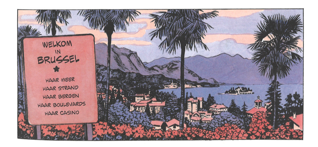
FIGURE Nº 17

such as line, colour, and style stand in service of finding the 'emotional truth' instead. For example, the fleshy pink tones and washed-out blues could be argued to decrease the sense of urgency in the world, adding a sense of drama and romance to the climactic scenes of the textual relationship.