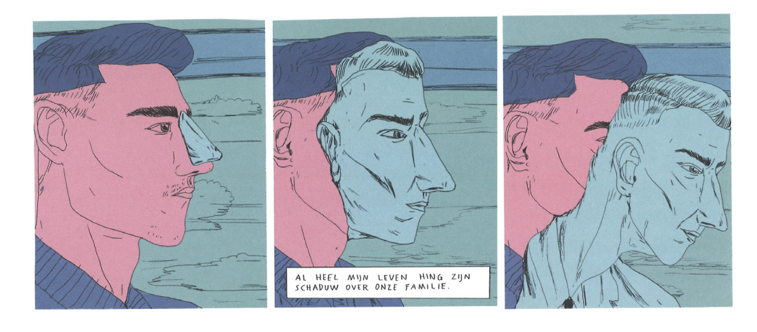
FIGURE No 12

Octavia Roodt (2020) Die Binnekamer, p.7 (excerpt). Copyright © 2020 Octavia Roodt; English translation © Octavia Roodt.