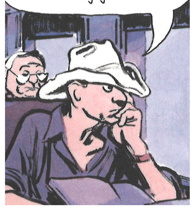
FIGURE No 4