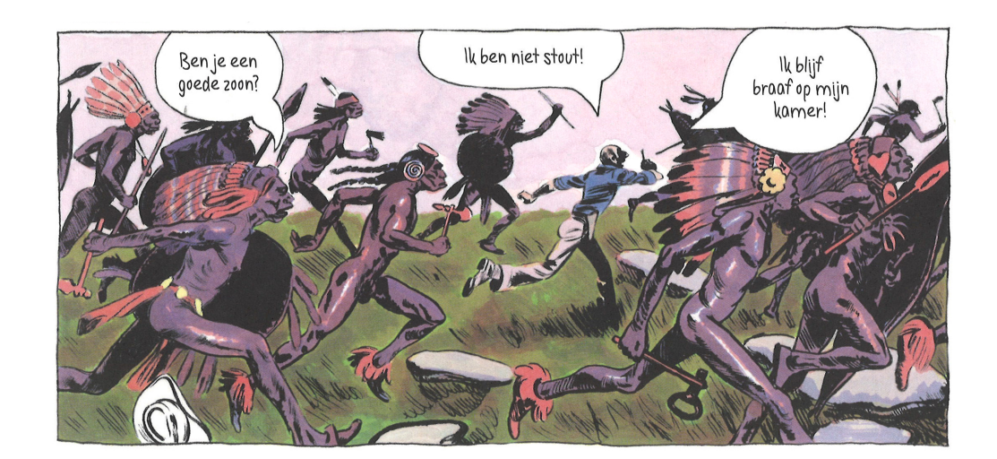
figure No 14

Blutch (2022) La mer à boire , p.115 (excerpt). Copyright © 2022 Blutch & Éditions 2024. Dutch translation © Concerto Books.