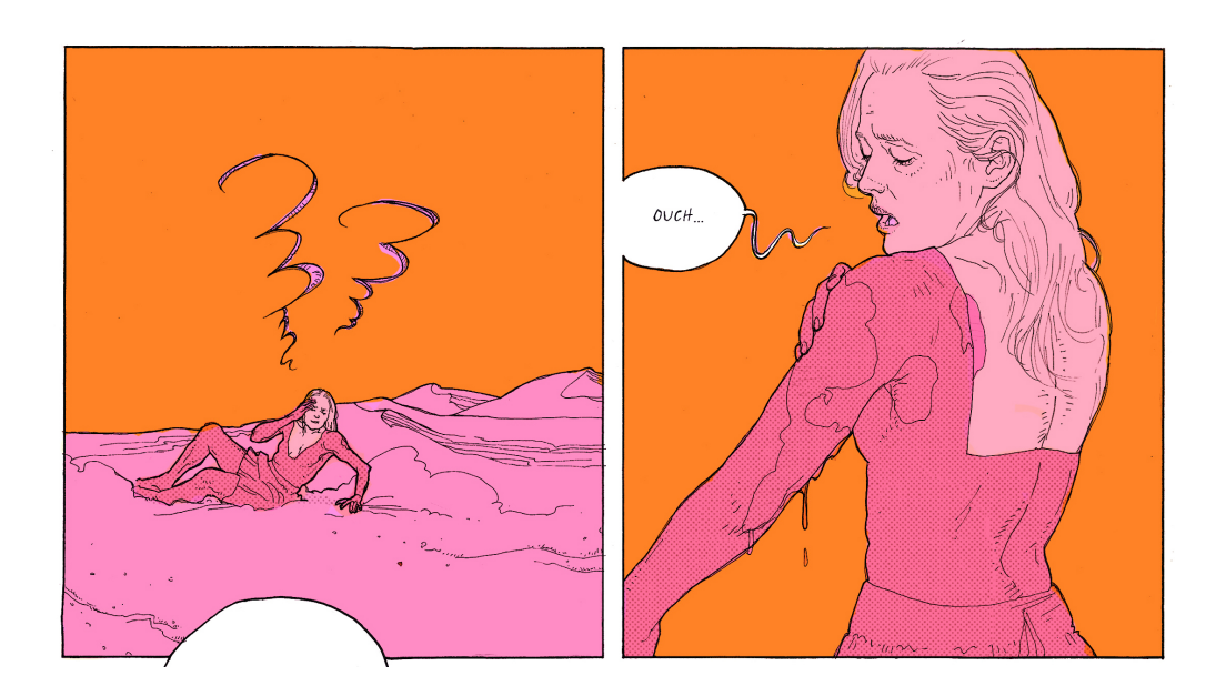
FIGURE Nº 11

Octavia Roodt (2020) Die Binnekamer, p.7 (excerpt). Copyright © 2020 Octavia Roodt; English translation © Octavia Roodt.