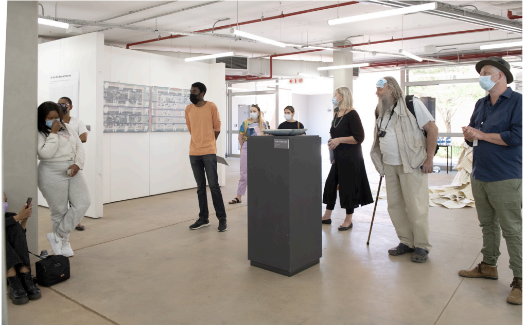
FIGURE Nº 7