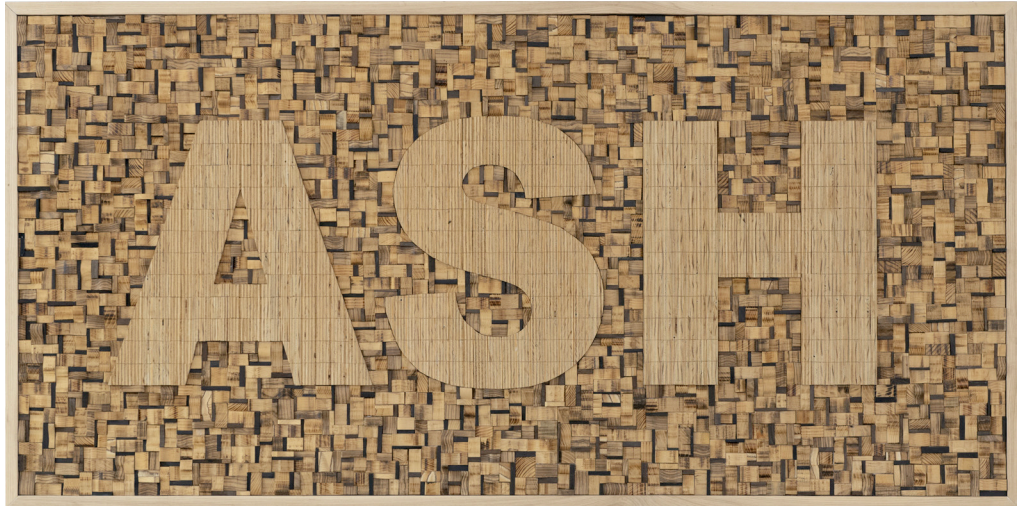
FIGURE N° 1