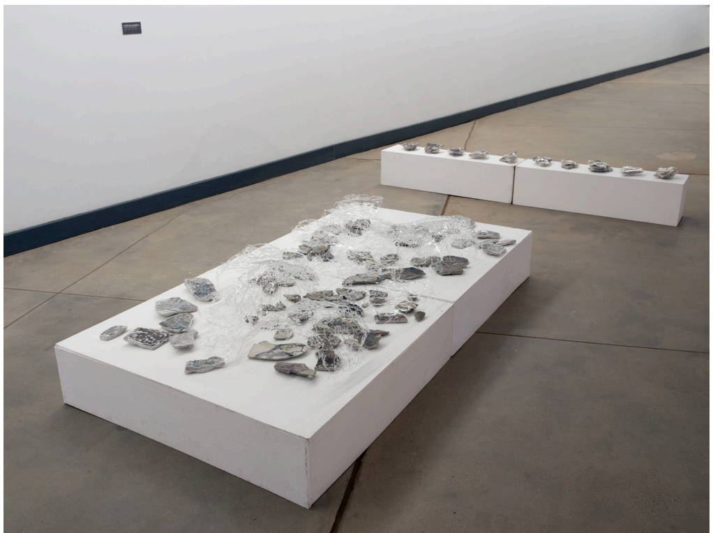
FIGURE N° 2

Willem Boshoff. Ash (2018). Ash wood and mixed mediums. Sizes: 925 x 1850mm.