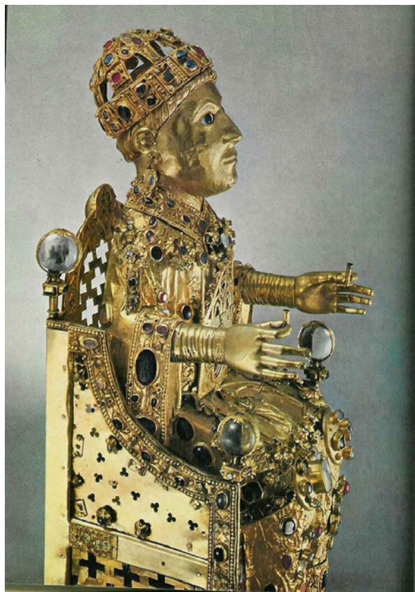
FIGURE N° 3

The traces of Skotnes's obsessive writing on and handling, working, gilding, plating, touching of the once living bones of horses make them comparable to medieval reliquaries (Greenblatt 2009:58-71), and in the context of her installations, are reminiscent of acts of commemoration in the devotional use of the rosary (Hofmeyr 2009:76-101).