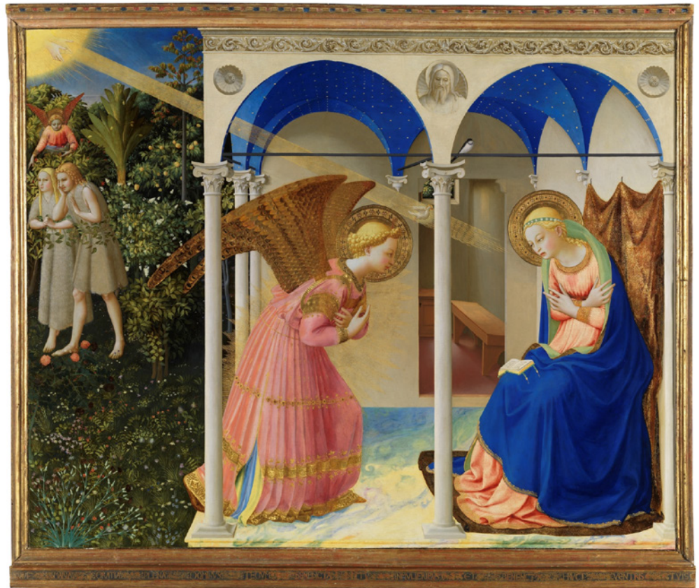
FIGURE N° 5