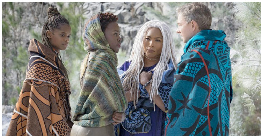
FIGURE Nº 2