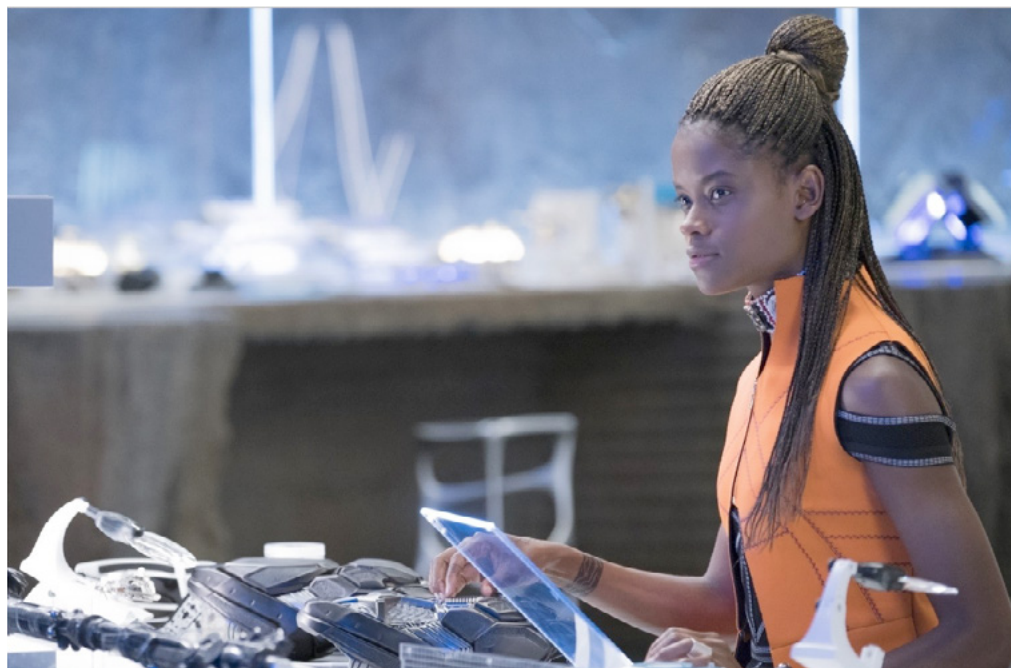
FIGURE N° 4