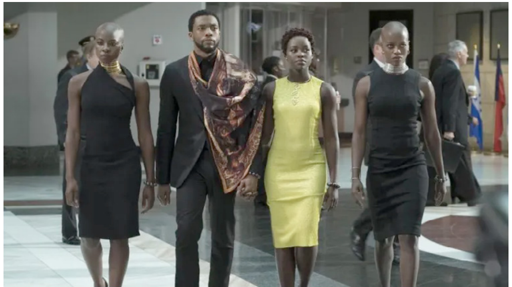
FIGURE N° 3