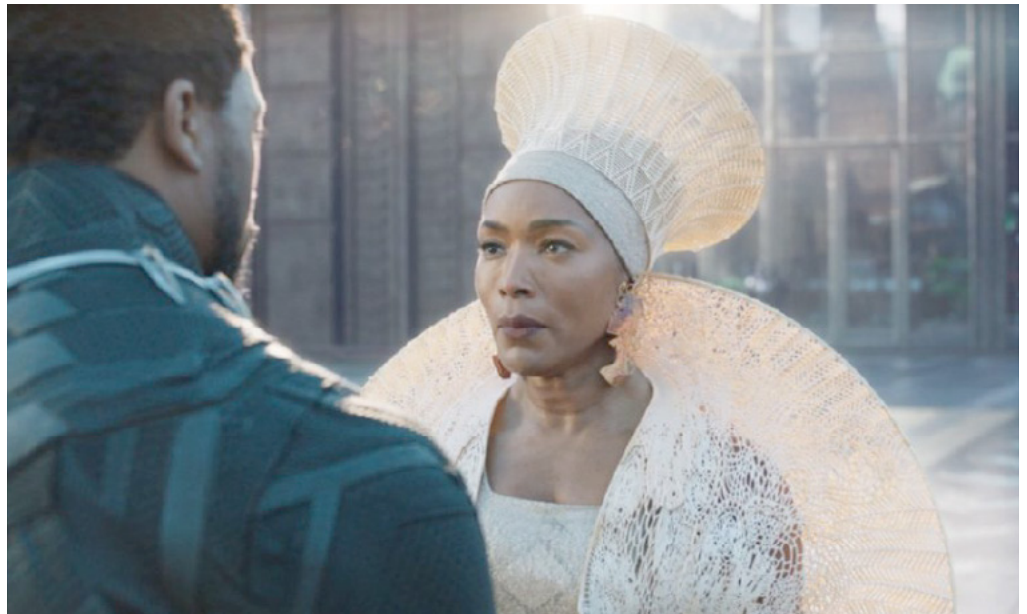
FIGURE Nº 5