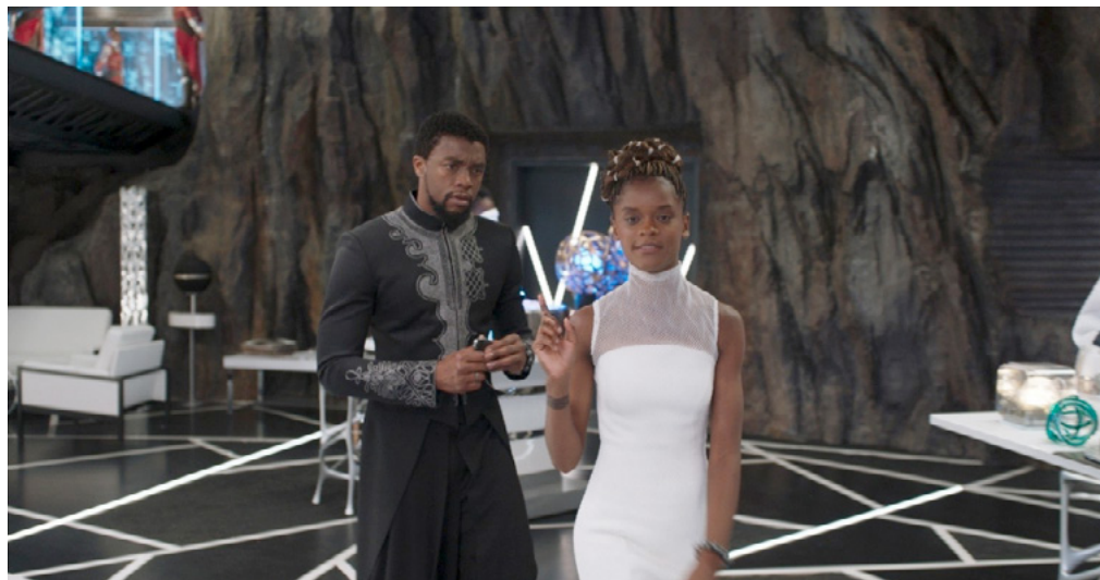
FIGURE N° 6