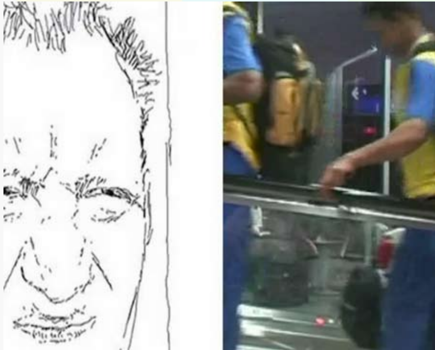
Figure 4a: M Edwards, detail from Authentic – not authentic

of reading and negotiating bookness. For the purposes of this article, I limit my discussion to an analysis of Edwards', Authentic - not authentic, self practice from 11/04/05 to 12/05/06 (Figure 2) and Emmanuel's The Lost Men Project (Grahamstown) (Figure 3).