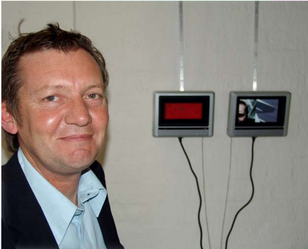
Figure 2: M Edwards, Authentic – not authentic, self practice from 11/04/05 to 12/05/06

Zaayman (2005:159) cites Mark Postner's notion of digital media within the public sphere as 'a space' rather than 'a tool', and suggests that 'this new mental space constitutes a virtual geography of sorts, and like any space, the topogra-