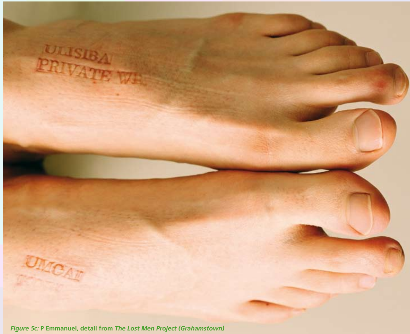
Figure 5c: P Emmanuel, detail from The Lost Men Project (Grahamstown)

For Edwards, the construction of an ambiguous and flux-laden relationship between images and sounds spawns an equivalent of the imaginative narrative that reading might release. In this way, the interrelationship and sharp disjuncture between the elements of this work read as 'the book about the experience of reading a book dealing with Edwards' particular choices of texts and images'. Yet I believe that he moves even further. Through this ambiguous relationship between image and sound, Edwards is perhaps responding to, and answering, Helfand's (2001:127) concerns that sound, as an often overly determined and orchestrated component in the visualisation of ideas, can represent