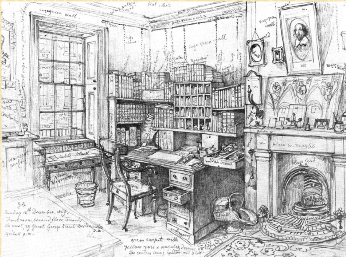
Figure 2: The study, 29 Great George Street, London, drawing by George Scharf, 1869 (Lasdun 1981:99).

especially crowded. One can almost not discern the door and walls for all the clutter: bookshelves brimming with books, framed prints and paintings cover the walls, while two work tables and a desk fill the floor. The visible sections