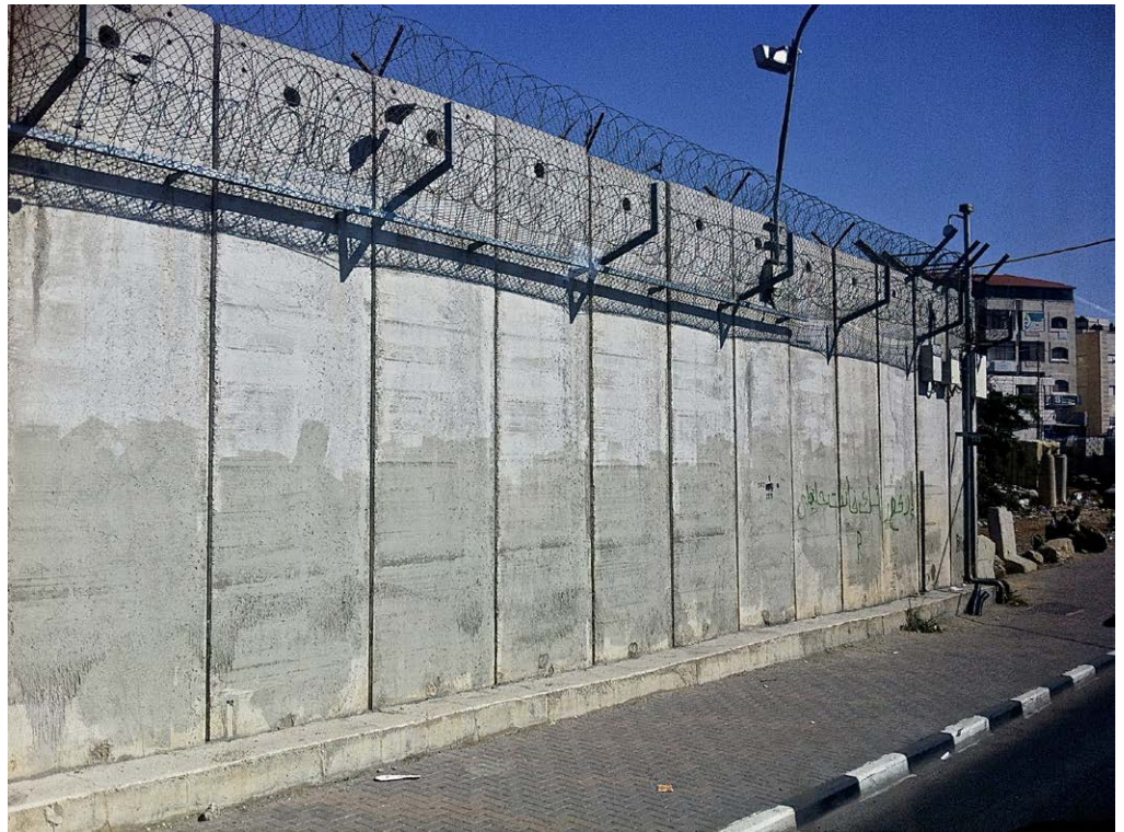
FIGURE N° 3