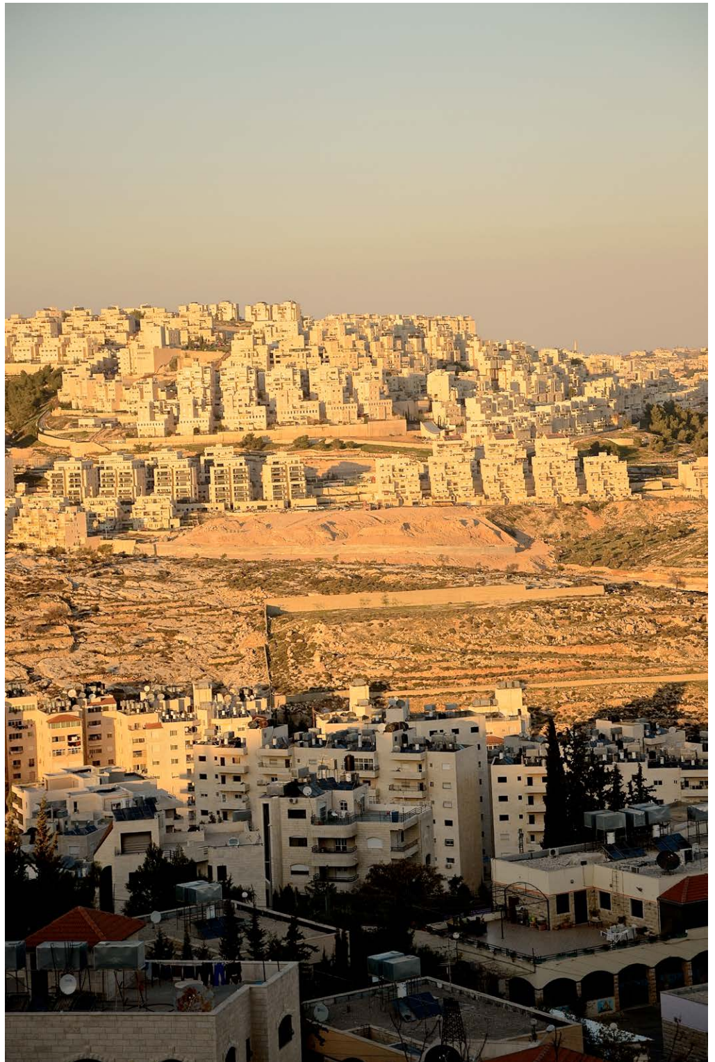
FIGURE Nº 8