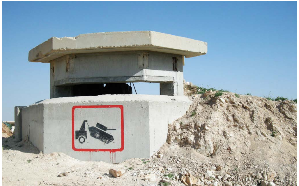
FIGURE Nº 1