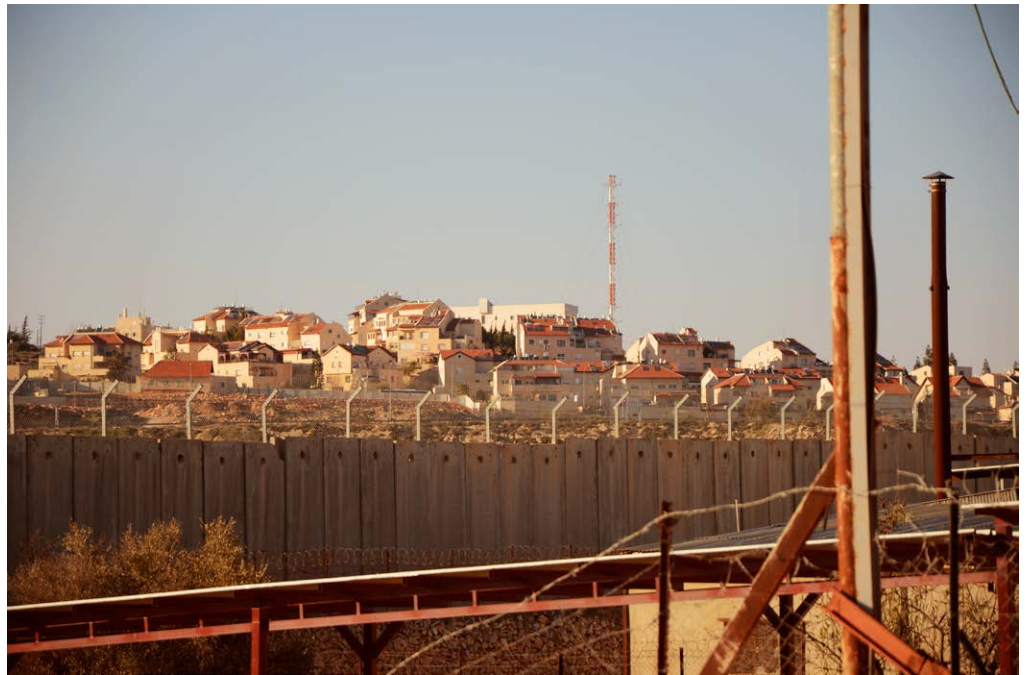
FIGURE N° 9