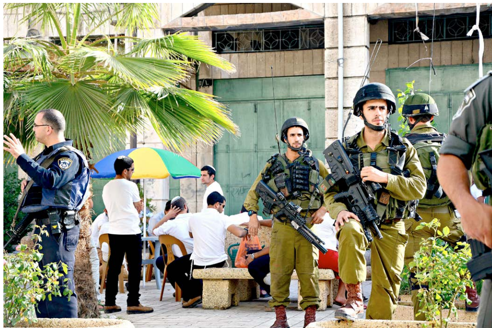
FIGURE N° 6