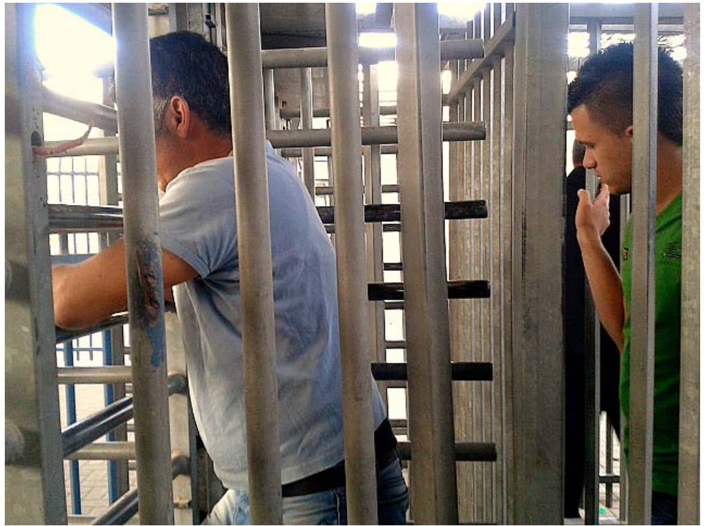
FIGURE Nº 7b