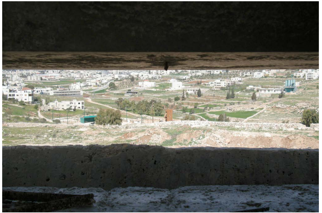
FIGURE N° 10