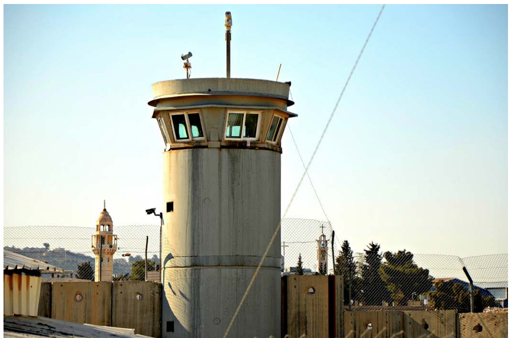
FIGURE N° 4b

Documentation of a watch tower, photographed along route 60 between Jerusalem and Bethlehem, January 2014.