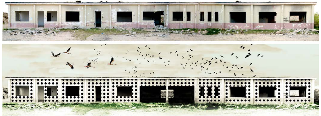
FIGURE N° 11b