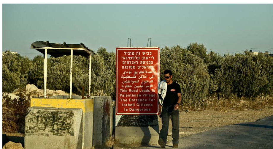
FIGURE N° 2b

Photographic documentation of one of the red and white warning signs positioned at the Qalandia checkpoint between Ramallah and Jerusalem. The sign is written in Hebrew, Arabic and English. In English it reads 'This Road leads to Area "A" Under the Palestinian Authority The Entrance for Israeli Citizens is Forbidden, Dangerous to Your Lives And Is Against the Israeli Law'.