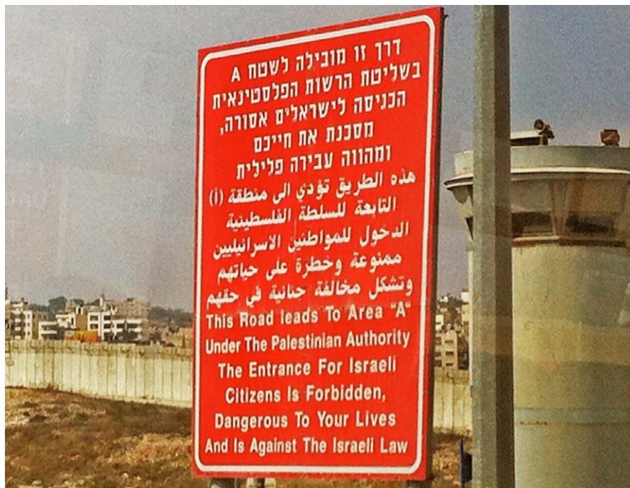
FIGURE N° 2a