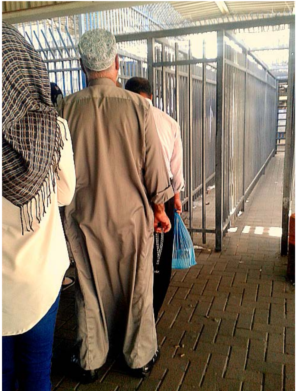
FIGURE N° 7a