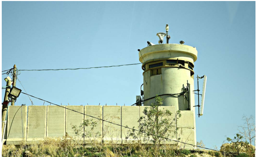
FIGURE N° 4a