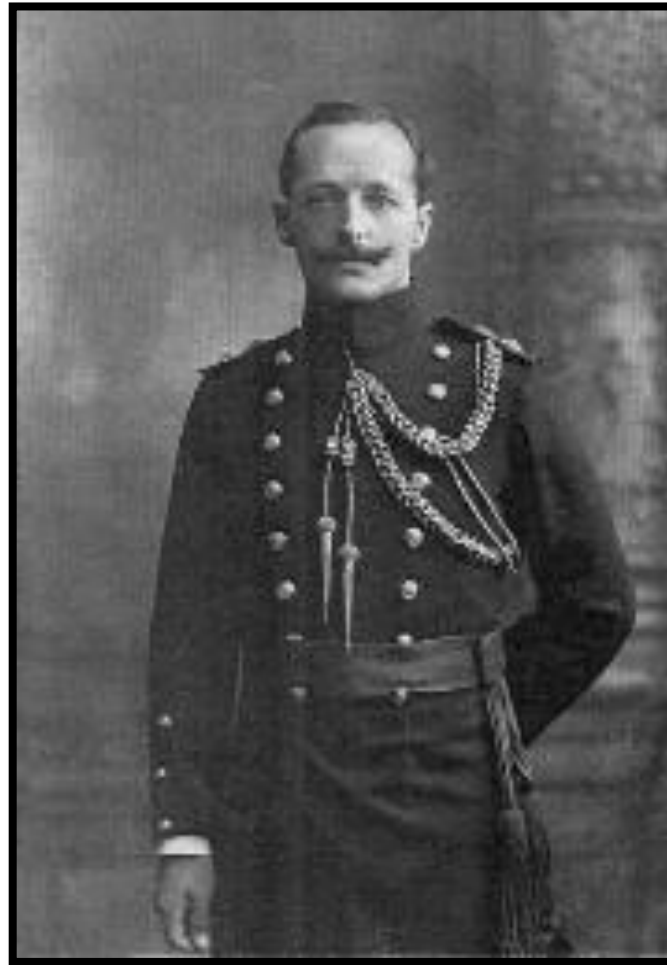
Figure 1: Brigadier-General Wilfrid Malleson (1866–1946) 44

his men had been given their arms and uniform on board the transport at Durban. 43