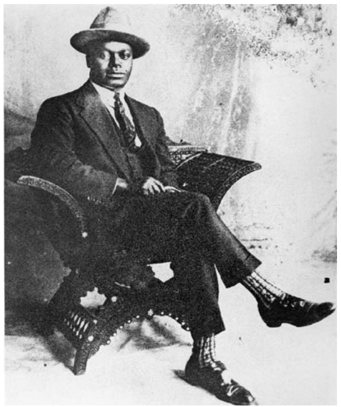
Pixley ka Isaka Seme.

addition to abolishing the colonial relationship, establishing democracy to secure self-determination, it would also have to unify the South African people and act as the midwife at the birth of a new nation <sup>18</sup>