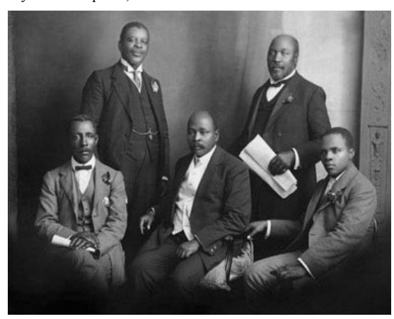
Early SANNC delegation, 1914.

Your cattle are gone, my countrymen! Go rescue them! Go rescue them! Leave the breechloader alone And turn to the pen Take paper and ink, For that is your shield Your rights are going! So pick up your pen Load it, load it with ink Sit on a chair Repair not to Hoho But fire with your pen 12