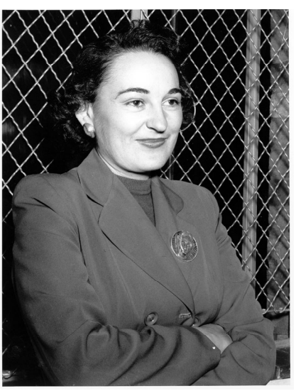
Ruth First.

The 1950s was a decade of mass struggle for both women and men. Although men were in the leadership of the ANC and its allies, some women, like the assassinated Ruth First, wife of late Communist leader Joe Slovo, definitely wielded considerable authority often at an informal or secret level through the underground