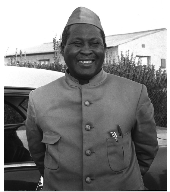
Chief A bert Luthuli in Congress volunteers uniform.

This pattern of dress is replicated in other liberation movements and was initially used by Indians in South Africa, including Gandhi, when they made representations. But we should also note the frequent use of non-Western clothing in other parts of Africa, and notably by Mahatma Gandhi in India, as a signifier of difference, distantiation, affirmation of identity and rejection of British overlordship. Gandhi specifically chose this dress in order to signify difference and alienation from Britain.<sup>36</sup> At the same time, while intending to emphasise a specific identity, the "Gandhi cap/topi" can be seen to have become "internationalised", as is evident from its adoption by Luthuli and its use as the uniform of Congress volunteers in the 1950s.<sup>37</sup> Gandhi had specifically chosen this cap or had it adapted from the Kashmiri hat as an emblem of the Indian struggle and nation to be.<sup>38</sup> Examples of such emphasis on local cultural dress to stress an identity alien to the coloniser in nationalist movements are common on the African continent.<sup>39</sup>