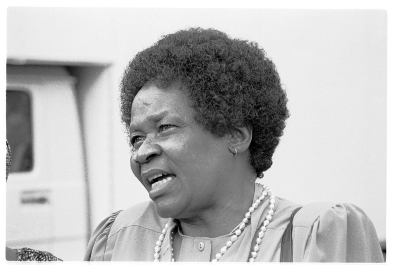
Albertina Sisulu.

In the case of many of the prominent ANC and Communist Party leaders it is clear that their womenfolk were not confined to the kitchen. The marriage of Walter and Albertina Sisulu is an affirmation of the notion of conventional family in its most powerful sense and of a relationship of equality with the extended family maintained, despite decades of separation while Walter was imprisoned. But they also play out the ANC notion of the "organisation as family" and Albertina Sisulu, in the absence of Walter, was not only a mother to her own children, but also embraced and communicated a heritage of struggle to a younger generation generally referred to as her children, in addition to her own children. She herself was a founder figure of the reconstituted ANC underground after the Rivonia trial and has remained an organisational stalwart in her own right throughout her adult life.