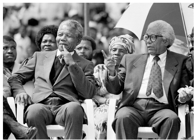
Mandela and Sisulu at a rally after their release.

was reprimanded more than once for speaking of or implying resort to armed action or resistance before an organisational decision to that effect had been taken. While accepting the reprimand at the time, he was in fact unrepentant and believed that he represented the mood of the time. 89